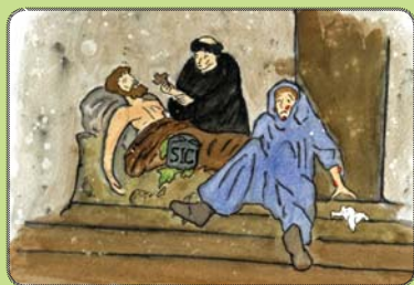
1348 Victims of the Plague

TASK Can you find the monks in the picture?