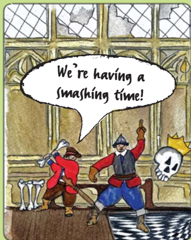
1642-48 Roundheads attack the Cathedral