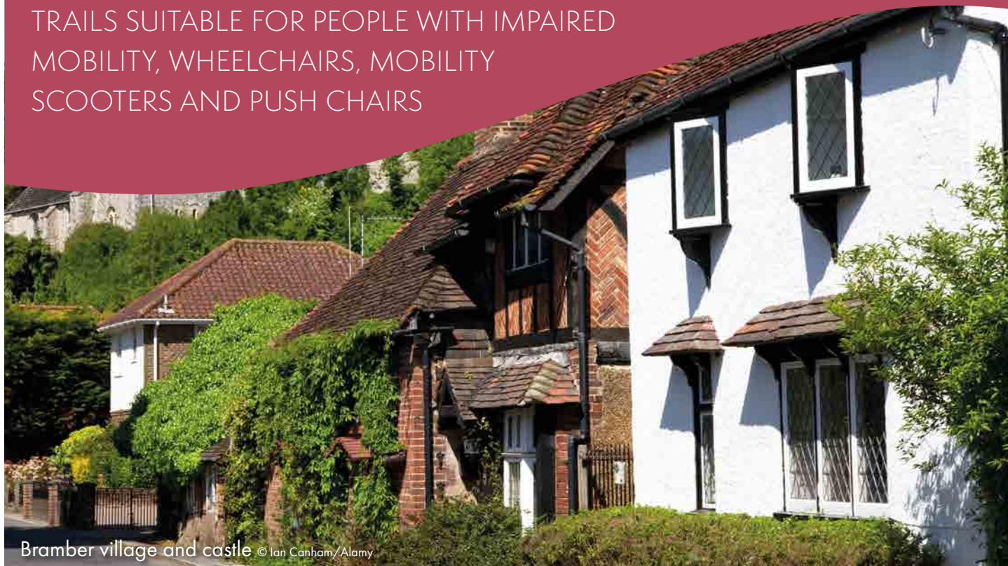
Bramber village and castle

TRAILS SUITABLE FOR PEOPLE WITH IMPAIRED MOBILITY, WHEELCHAIRS, MOBILITY SCOOTERS AND PUSH CHAIRS