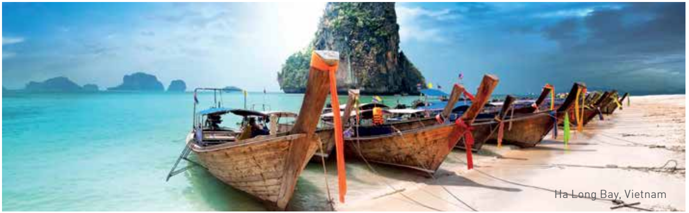
Ha Long Bay, Vietnam