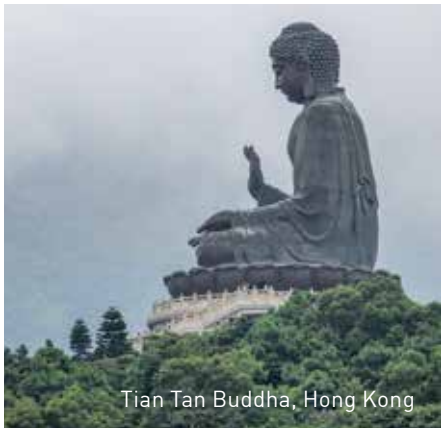
Tian Tan Buddha, Hong Kong