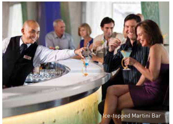
Ice-topped Martini Bar